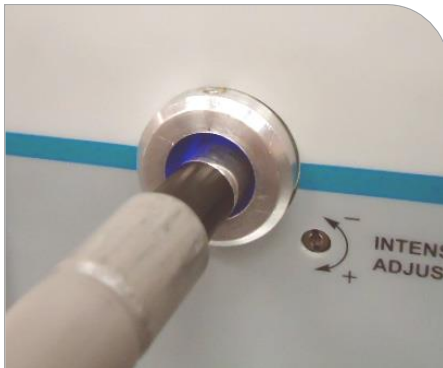
Figure 1. Insert Lightguide into Lightguide Mount

NOTE: Multi-Leg Lightguides should be balanced by rotating the Lightguide to obtain the desired UV intensity of each leg before lightly tightening the Setscrew.