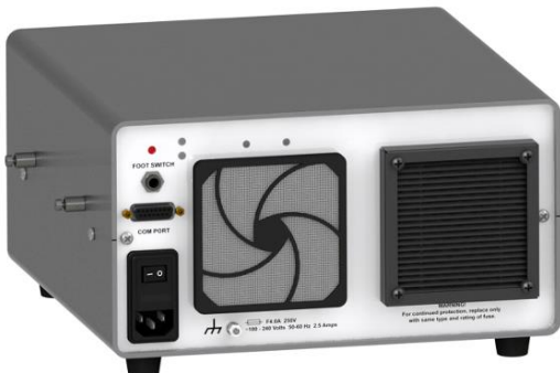
Figure 3. Rear Connections