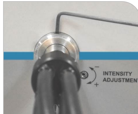
Figure 2. Gently Tighten Setscrew on Lightguide Mount with Hex Wrench