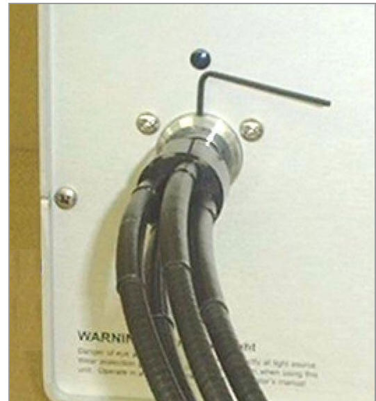
Figure 2. Tighten Set Screw with Hex Wrench

© 2003-2010 Dymax Corporation. All rights reserved. All trademarks in this guide, except where noted, are the property of, or used under license by Dymax Corporation, U.S.A.