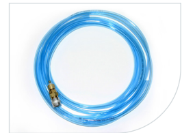
Reservoir Air Line Kit