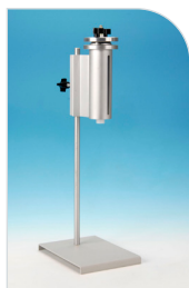
6 oz (160 mL)