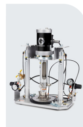
Mini Ram Pump