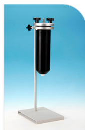
20 oz (550 mL)