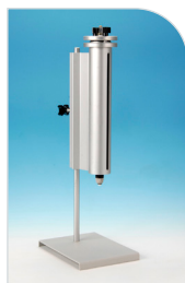
12 oz (300 mL)