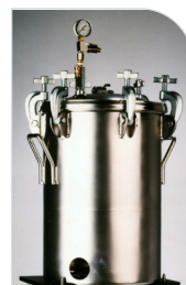
Pail Drop-In Reservoir