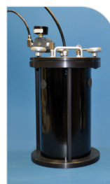
Bottle Drop-In Reservoir