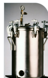
Pail Drop-In Reservoir