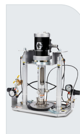
Mini Ram Pump