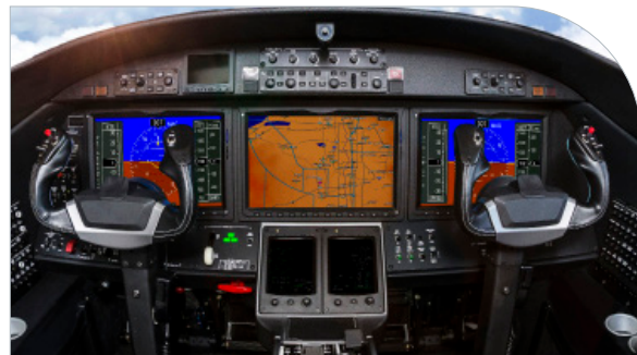
Optical bonding increases clarity, viewing angle, and vibration resistance

The “on-demand cure” of these adhesives allows substrates to be repositioned precisely until parts are ready to be cured. Using a thin layer of Dymax adhesive controls cost and can reduce the weight of the final product. The adhesive also acts as a barrier against stress, significantly improving product reliability and warranty costs. Dymax display adhesives come in a variety of viscosities for ease of use and controlled dispensing and are available in a wide range of packaging sizes.